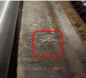
ACCUMULATED SCRAP AT SHIELD PLATE